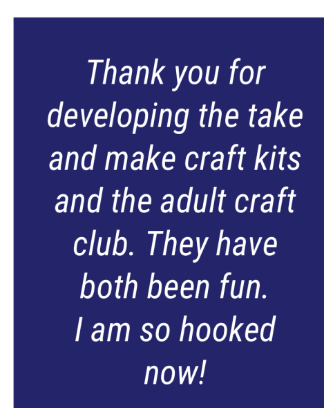
Thank you for developing the take and make craft kits and the adult craft club. They have both been fun. I am so hooked now!