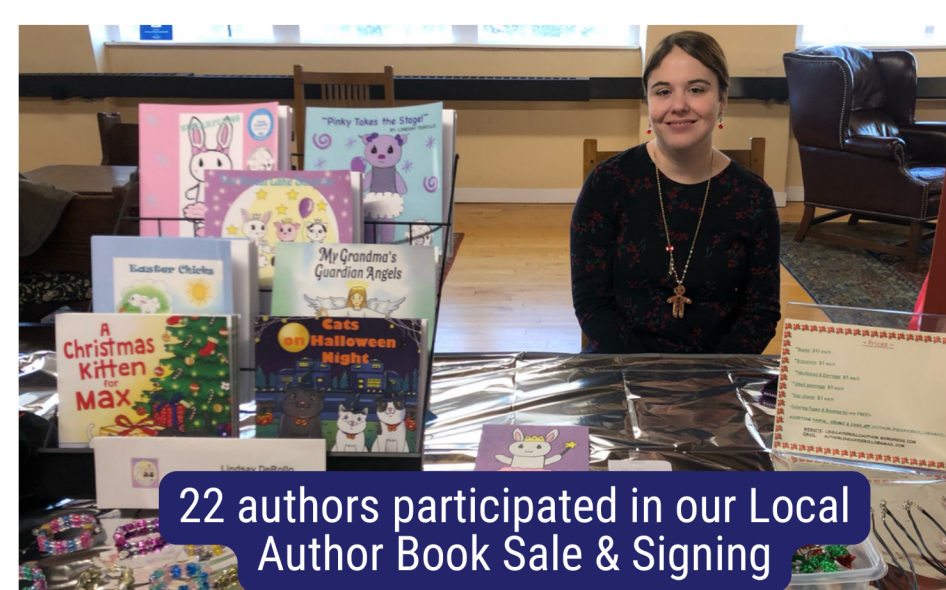
22 authors participated in our Local Author Book Sale & Signing