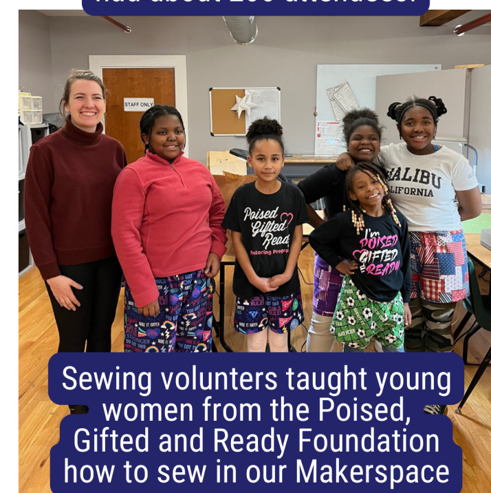
Sewing volunteers taught young women from the Poised, Gifted and Ready Foundation how to sew in our Makerspace