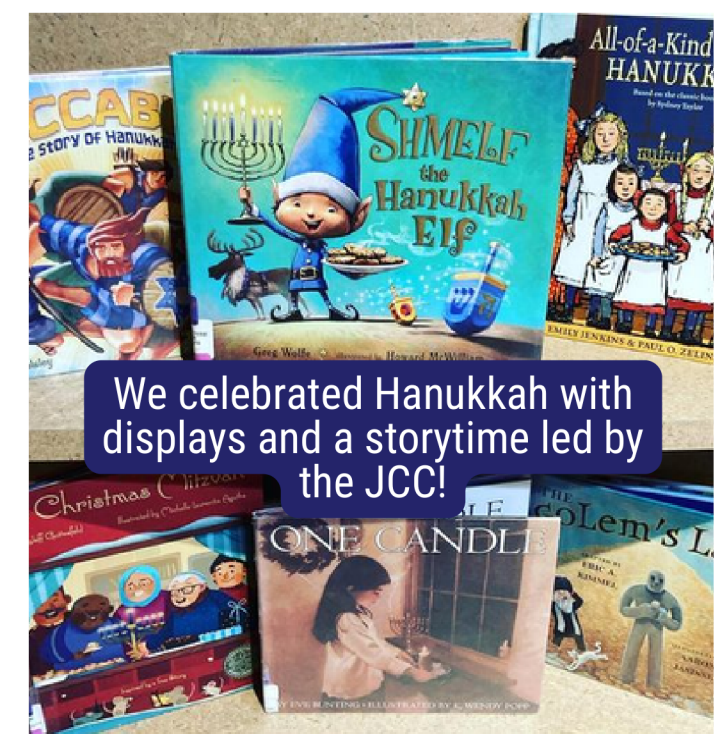
We celebrated Hanukkah with displays and a storytime led by the JCC!