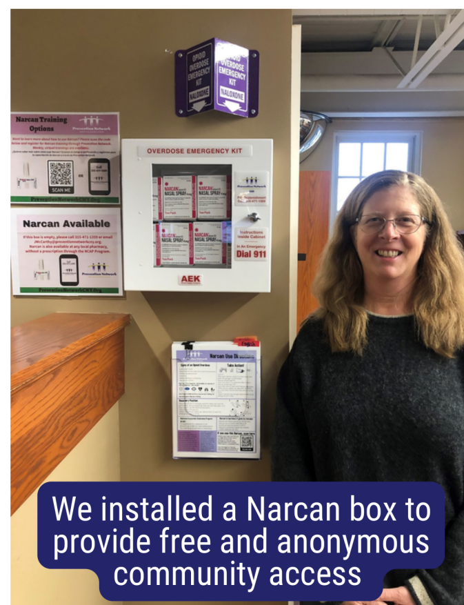
We installed a Narcan box to provide free and anonymous community access