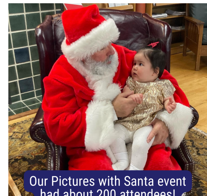
Our Pictures with Santa event had about 200 attendees!