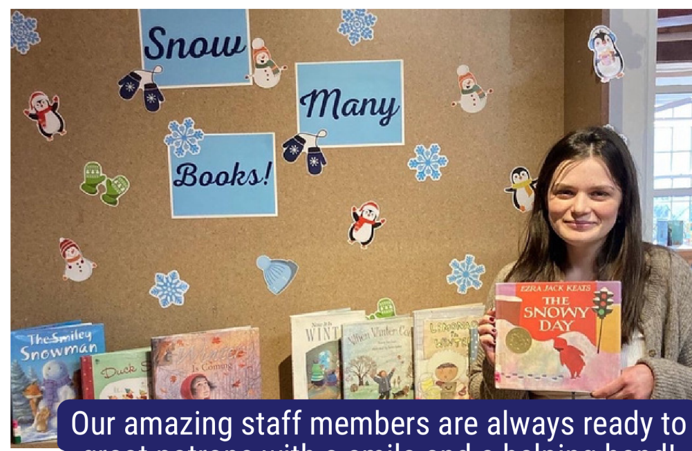
Our amazing staff members are always ready to great patrons with a smile and a helping hand!