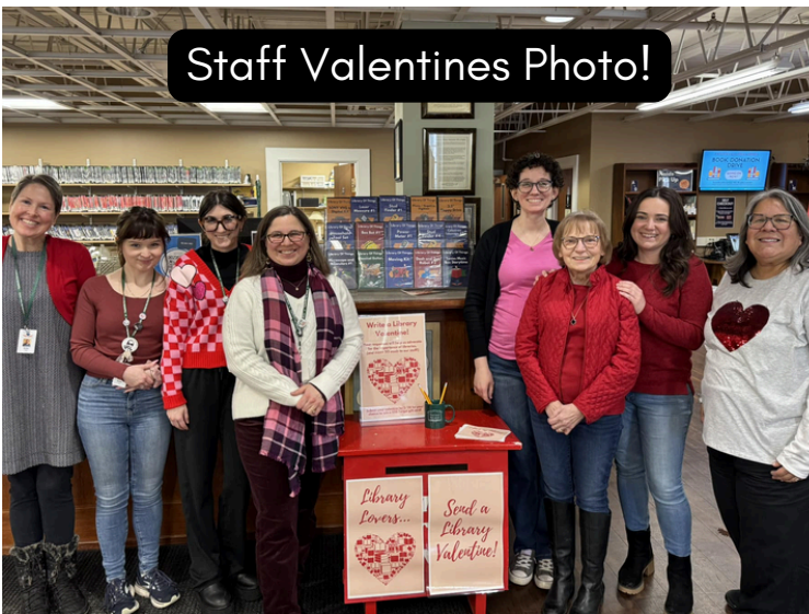
Staff Valentines Photo!

My library is one of my favorite places! It's welcoming, I feel comfortable, great staff, pleasant surroundings and I love selecting books.