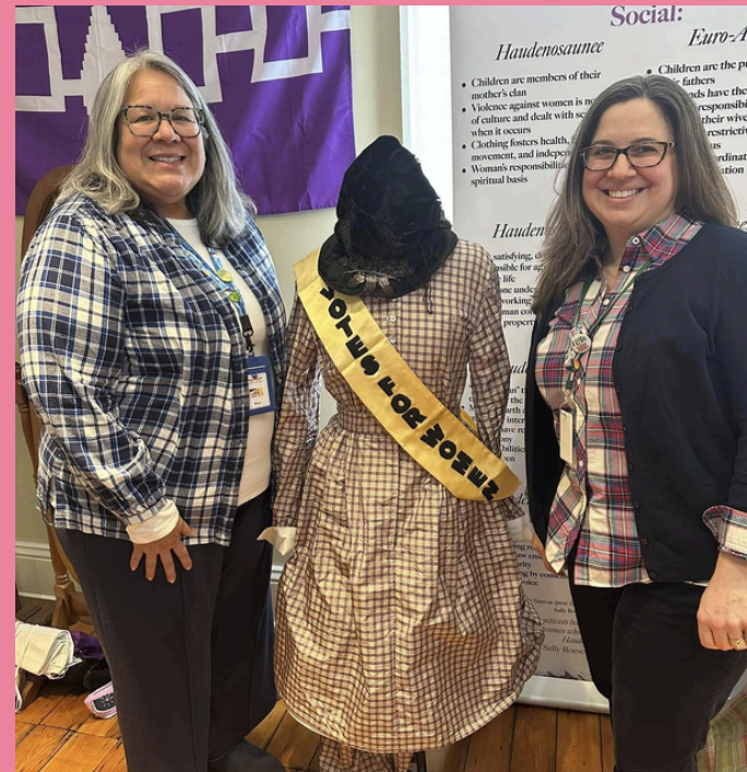
We visited the Gage Center and discussed exciting future collaborations

Severe winter weather caused lower attendance as compared to this period last year