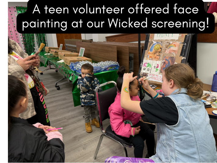
A teen volunteer offered face painting at our Wicked screening!

We always feel like we belong there. Every time we visit, we see displays of works that celebrate different identities. Seeing our own makes us feel seen. Discovering others makes our world bigger. It's not just a place to seek knowledge; we experience community there.