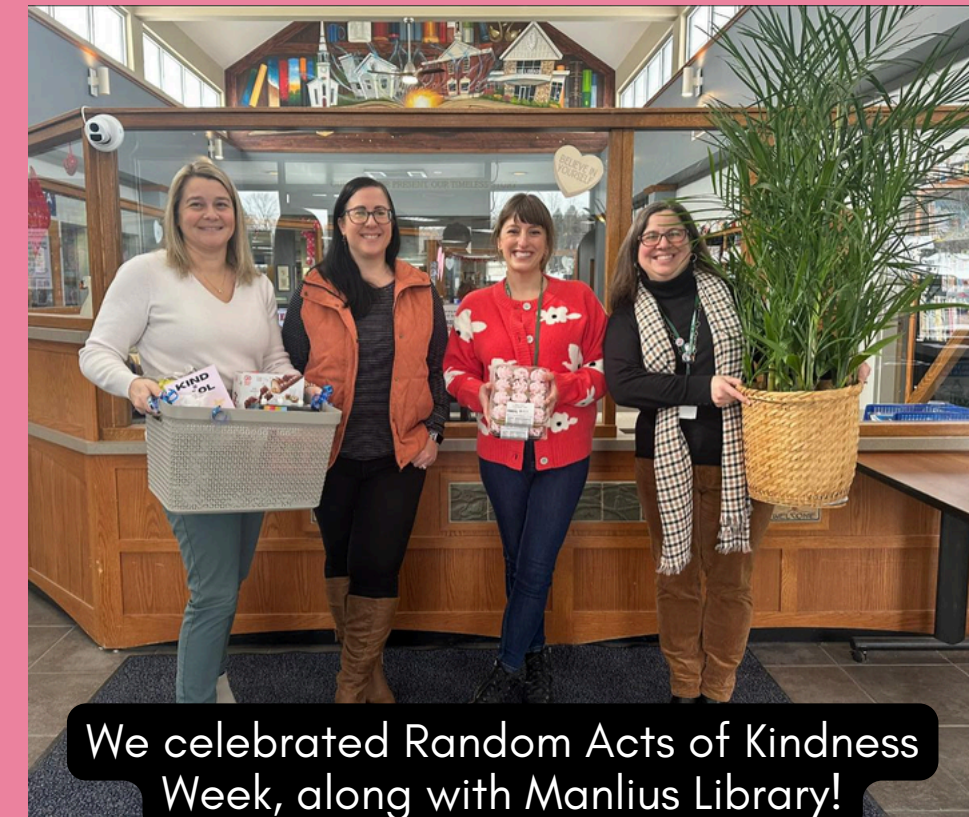
We celebrated Random Acts of Kindness Week, along with Manlius Library!

We loaned 35,336 physical items (25% more than last year) and 13,729 digital items