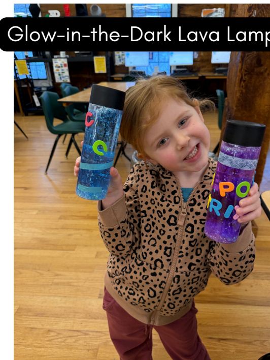
Glow-in-the-Dark Lava Lamps

I use it as a resource to find fun, engaging books that I can read to my preschool students! I love how cool they think it is when I bring in books from the library.