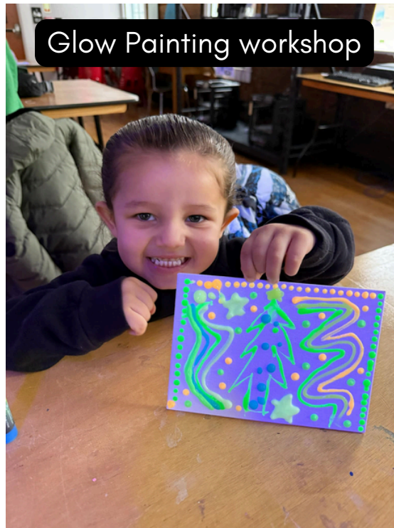
Glow Painting workshop

I appreciate being able to attend interesting programs that allow me to explore creativity in a judge-free zone. The staff at Fayetteville Free Library make every experience there a great one.