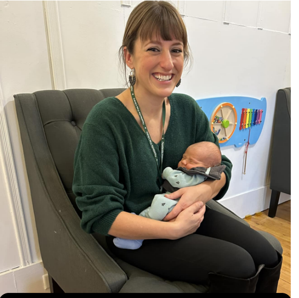
We love it when brand new babies come to storytime!